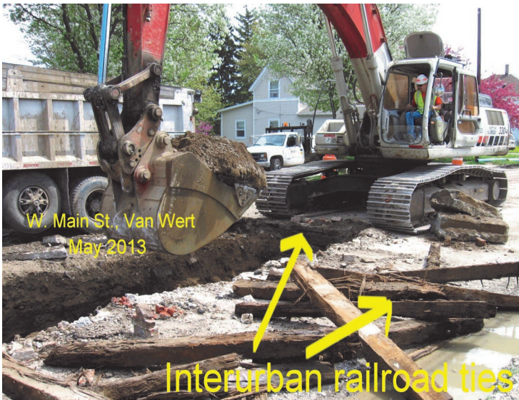
Photo: W. Main St., Van Wert, May 2013-Interurban RR ties being removed from the middle of the street.

New railroad artifacts have been installed on the east side of the red caboose in 2013. There are now two flashers from the South Shannon Street railroad crossing, circa 1930s, standing proudly by the caboose. (These tracks were part of the Cincinnati Northern, owned by The Big Four, in turned owned by the vast New York Central system.) The flashers were installed by the Van Wert County Engineers office on May 23, 2013. Alexander & Bebout prepared the mounting holes and K & L Ready Mix (John Brown Rd.) donated the concrete for setting the flashers.