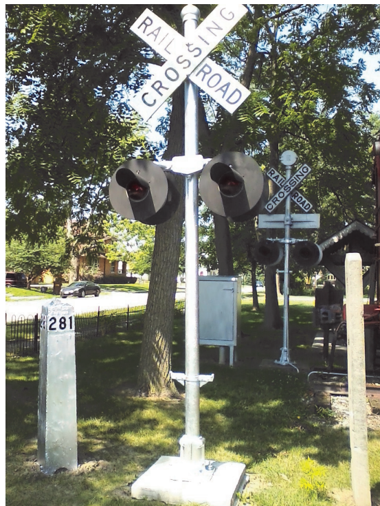
"281" mile marker, a Shannon Street Cincinnati Northern Railroad flasher and a whistle marker. The flasher from Elida, Ohio, installed in the 1990s, and the control box installed in 2002, are in the background.