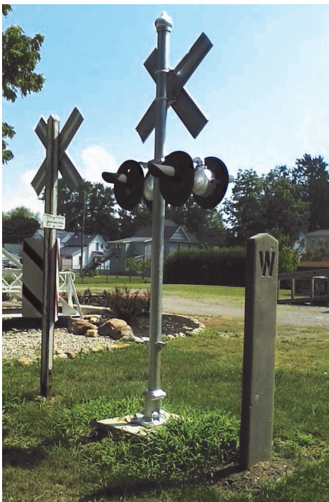
The new installation of the railroad signals and markers.

The Museum contains a large model railroad exhibit and many railroad history artifacts. This display is located in the basement of the Museum.